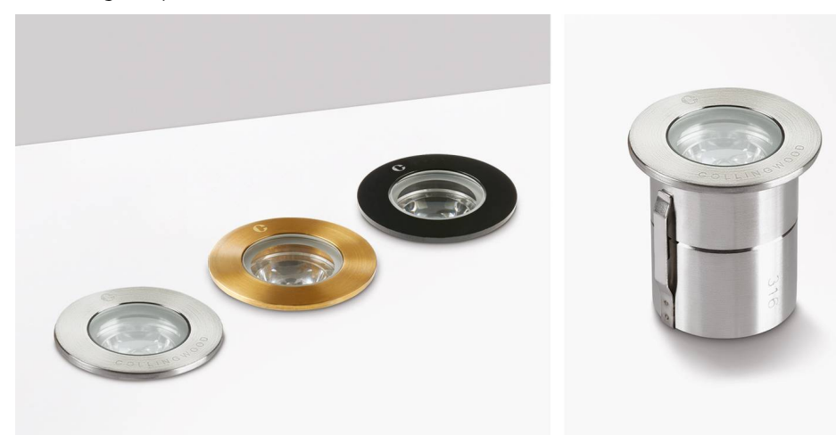
Ground lights specification sheet